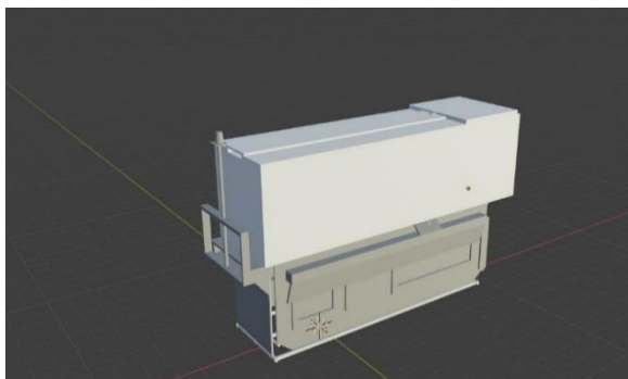
Fig. 2. Overall design

Another part of this automatic clothesline system is the monitoring application on the user's mobile phone. The application consists of a streaming panel, an LED on button and an LED off button. The streaming display will turn on automatically when the system is activated. The LED on button functions to turn on the LED flash while the LED off button functions to turn off the LED flash.