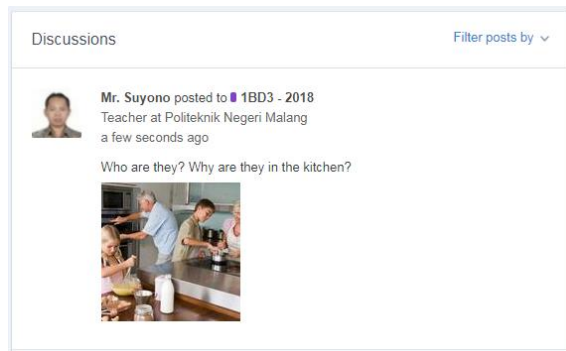
Fig. 2 A picture posted in chat

accompany their message. Pictures, as they are the focus of this article, can be attached in two different ways. The first one is by uploading a picture file from the local device and the second one is by adding a hyperlink referring to a particular online document in the Internet. Both methods will result in the same display, a thumbnail of the picture (see Fig. 2). Clicking on the thumbnail will enable the students to view the picture in its full size.